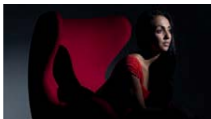
With Strobo Snoot