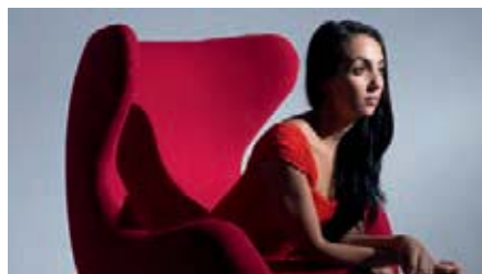
Without Strobo Snoot